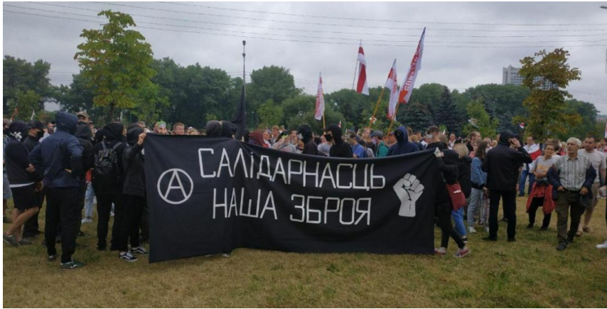
Анархисты на одном из воскресных маршей.

- The state crackdown against the anarchist movement in 2017 had an impact on the willingness to participate in liberal demonstrations in a large bloc. At that time, in Minsk alone about 50 anarchists were detained during the protests against the "parasitism" law. Some comrades were not able to get over the repression of those days.