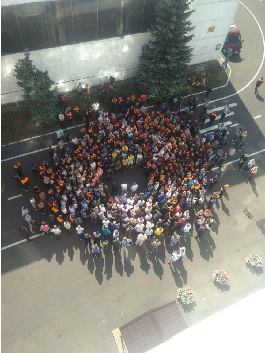
Meeting of the workers at one of the factories

In some cases, small private firms held one-day symbolic strikes to support the striking companies, but these actions did not have a mass character; the agitation was carried out only a few days before the