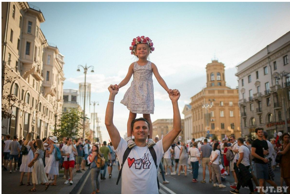
Participants of demonstration against Lukashenko in Minsk

cities, in the long run, the de-escalation played more to the advantage of Lukashenko and his gang, who regained control of the outlying regions one step at a time, while the media and activists mainly paid attention to what was happening in Minsk.