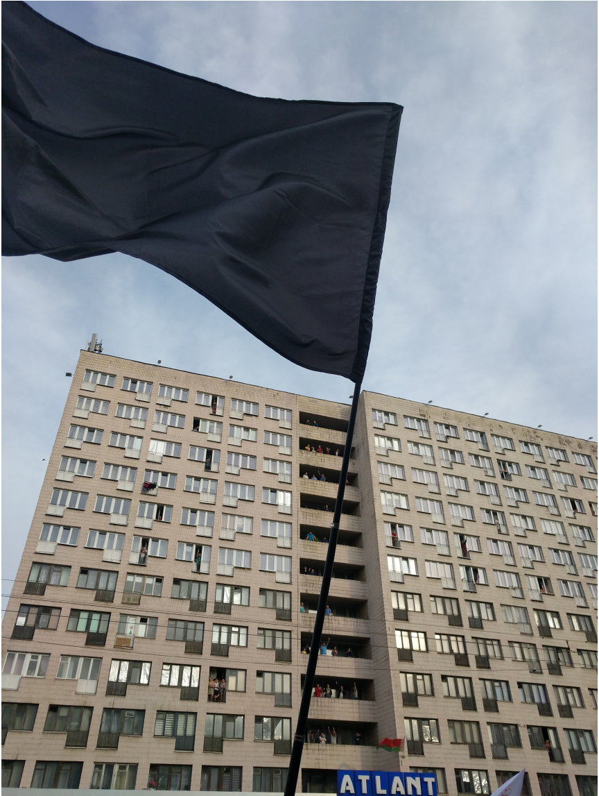
Anarchist flag at a demonstration in Minsk

ciety in many ways, from education to the workplace. It is logical that the same problems began to arise with small ringleaders within neighborhood initiatives.